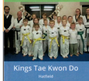
Kings Tae Kwon Do Hatfield