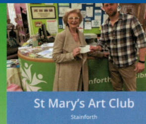
St Mary's Art Club Stainforth