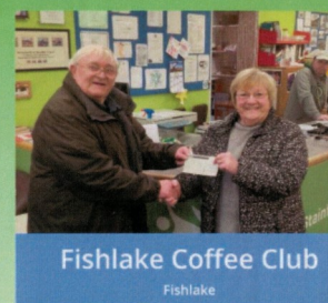
Fishlake Coffee Club Fishlake

S4ALL is committed to helping local groups and aspiring individuals by providing micro grants of up to £200.